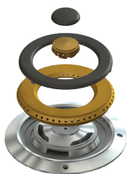
Pictured: ILVE Brass Burner

Functionally simple to use and a breeze to cook with, ILVE is truly the next generation in cooking.