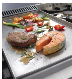
Pictured: ILVE Tepanyaki Plate