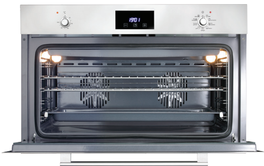
ULTRA-Clean smooth grey cavity with Twin Fan Oven Cavity