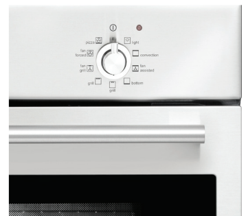
Laser etched cooking modes on control panel with symbol & words