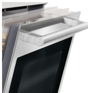
S-move soft & gentle closing door hinges