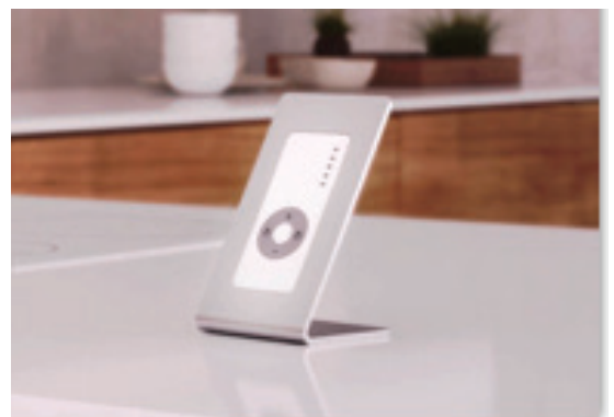
Pictured: CHR100X remote control (stand not included)