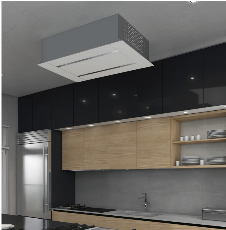
Pictured: CHR100X Ceiling Hood with re-circulating installation

Designed in a modern stainless steel and white glass finish with LED strip lights that produce a natural brightness, illuminating the cooking area. Powered by a sophisticated remote control, the range hood ensures complete control when using the cooktop.