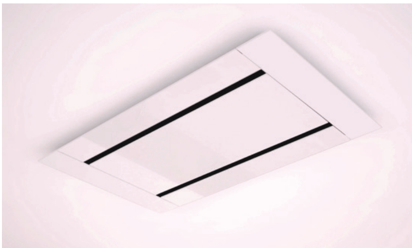
Pictured: CHR100X Ceiling Hood with ducted installation

The appliance's innovative "plug & play" system means the hood can easily be installed in either air recycling or duct out modes, making this ceiling hood extremely versatile. The upkeep of the CHR1000 has been kept to a minimum with a washable anti grease aluminum filter as well as a light, indicating when the grease filter needs cleaning and maintaining, leaving more time for the more important things in life.... Cooking!