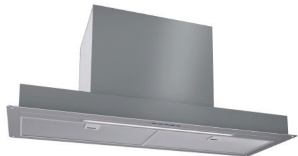
Pictured: IVCU 90 - 90cm Concealed Hood

ILVE's concealed rangehoods craftily stand above the rest. Their powerful high speed fan removes cooking odours, smoke and vapour from the kitchen, while extremely fine filters trap all grime. In-built LED Strip Lights produce a natural brightness, illuminating your cooking area while the streamlined electronic control panel ensures whisper quiet air extraction is at your fingertips. It's easy to see that ILVE Rangehood's are built to extract!