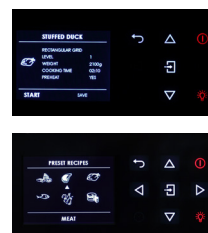
Preset Cooking & Smart Touch Control Panel