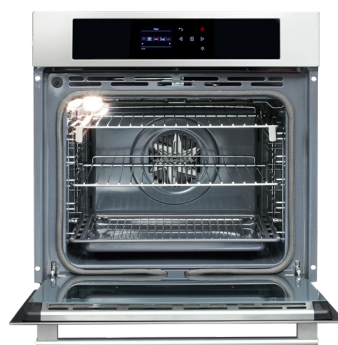
ULTRA-Clean smooth grey cavity