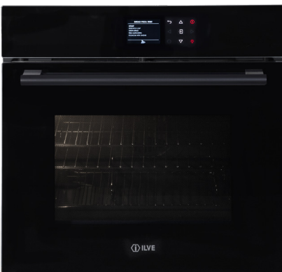
600SPYTCBV in Black Glass Finish

ILVE's new 600 Series large cavity ovens are the culmination of 2 years of research and development to bring Australian homes a oven that has the technology, sophistication and appearance that embodies the ILVE brand whilst having many functional advantages over its competitors.