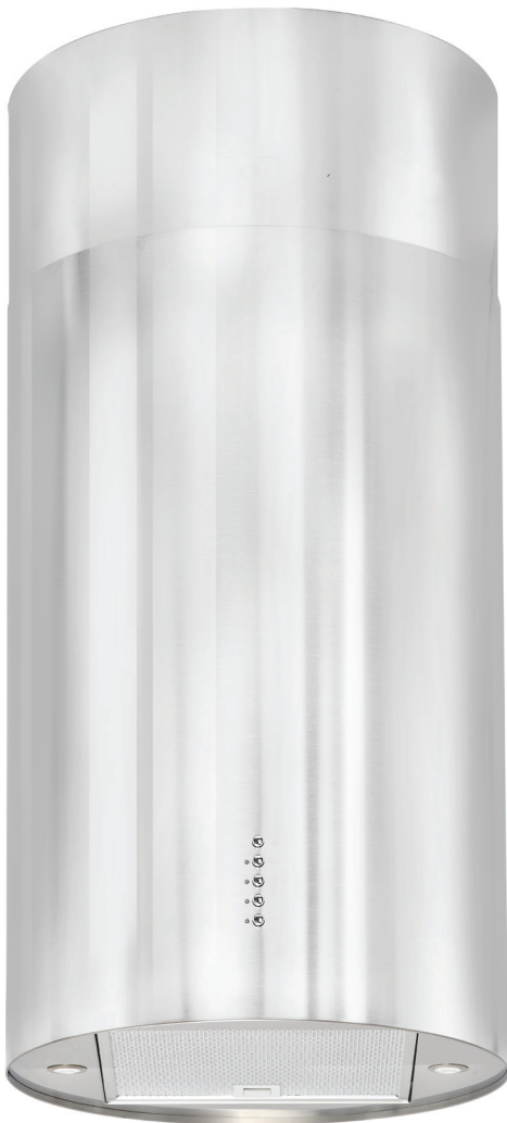
Pictured: • X370 Island Hood

ILVE's Island range hoods are designed to stealthily keep your kitchen fresher and cleaner. We all adore the scrumptious smells that billow from your favourite dishes in the kitchen, but not when those smells become stagnant within the home. ILVE's rangehoods are designed to stealthily keep your kitchen fresher and cleaner. Their powerful high speed fan removes cooking odours, smoke and vapour from the kitchen, while extremely fine filters trap all grime. It features intelligent features like the new ECO-booster, auto fire shut-down sensors and a filter cleaning reminder light. The smart timer function can be set for an automatic turn off leaving you to your culinary masterpiece at hand. In-built LED Lights produce a natural brightness, illuminating your cooking area while the streamlined electronic control panel ensures whisper quiet air extraction is at your fingertips. Either as a visual focal point or discreetly integrated, it is easy to see that ILVE Rangehood's are built to extract!