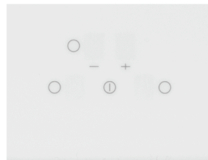
Pictured: ILD306W control panel