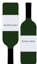
Capacity based on Bordeaux Bottles