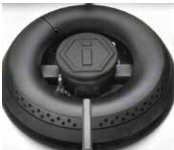
Pictured: ILVE Brass Burner

With ILVE Gas Cooktops, you can simmer at the lowest temperatures that your recipe calls for or go to searing heat instantly. With infinite precision heat settings you'll have perfect cooking control. Cleaning is easy! There are fewer food trapping cracks and crevices allowing for easy wipe maintenance. The trivets, burner caps and supports are removable and easily cleaned either in a dishwasher or by hand. A stainless steel finish ensures this cook top will co-ordinate beautifully with the design of other ILVE appliances. ILVE have maintained their core values as a family owned business and continue to manufacture appliances that represent the most pure thing in a family – dinner time! The kitchen is, and should always be, a place and a time where the family meets and shares.