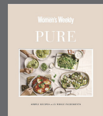
AWW 'PURE' COOKBOOK