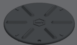
A/095/36/10 SIMMER / HEAT DIFFUSER

*Via redemption ONLY. Conditions apply, offer valid 1 July 2020 – 31 October 2020. New retail sales only, excludes T2, carton damaged, ex-display items and commercial sales. Visit www.ilve.promo for full conditions.