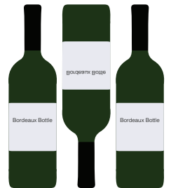
Capacity based on Bordeaux Bottles

Model ILWD154BV L&R 220–240V/50Hz 0.75 Amp rated current 10 Amp plug and cord