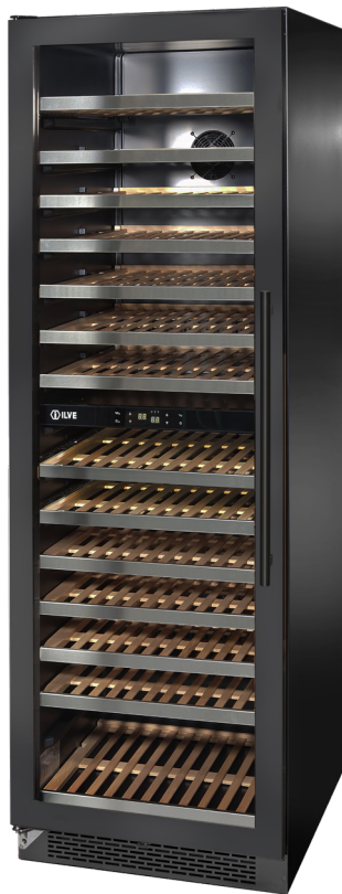
Pictured: ILWD154EVL (Left Hinge)

*image correct at the time of publishing