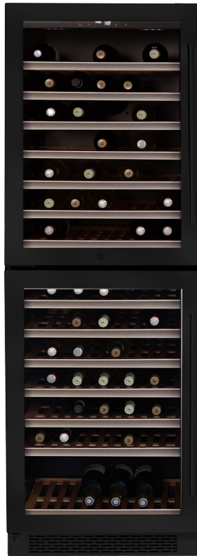
Pictured: ILWDD154BVL (Left Hinge)

*image correct at the time of publishing