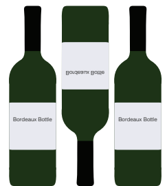
Capacity based on Bordeaux Bottles