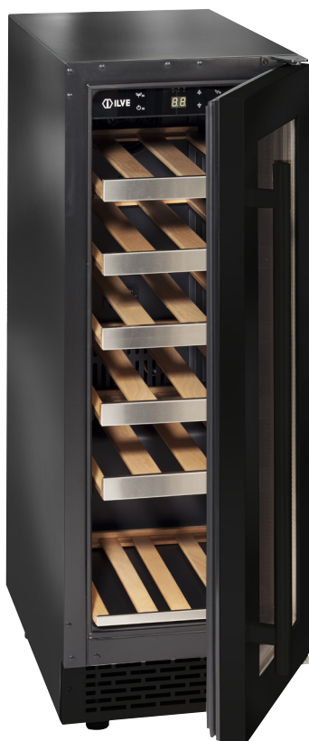
Pictured: ILWS18BV (Right Hinge)

*image correct at the time of publishing