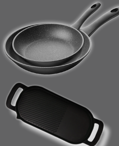
FRY PAN SET & GRIDDLE PLATE

*Conditions apply. Offer applies to all ILVE built-in cooktops 60cm and above. Excludes T2 & carton damaged stock, auction sites and ex-display. In-store retail sales only. Cannot be used in-conjunction with any other offer. Products are non transferable and cannot be swapped for other items. New orders only. Valid from February 19th 2021 until May 31st 2021. IGP1 & Fry Pans via redemption at www.ilve.promo .