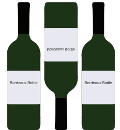
Capacity based on Bordeaux Bottles

Model ILWD154BV L&R 220–240V/50Hz 0.75 Amp rated current 10 Amp plug and cord