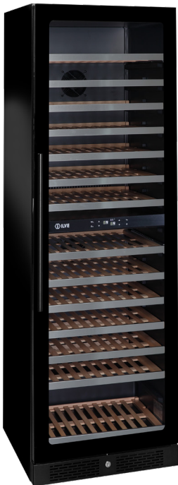
Pictured: ILWD154BVR (Right Hinge)